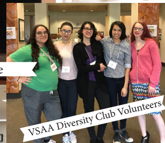
VSAA Diversity Club Volunteers