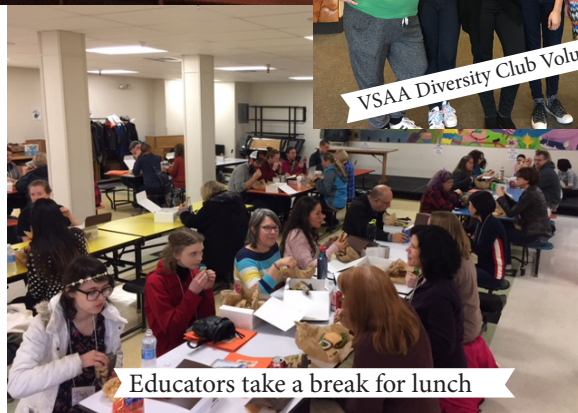
Educators take a break for lunch